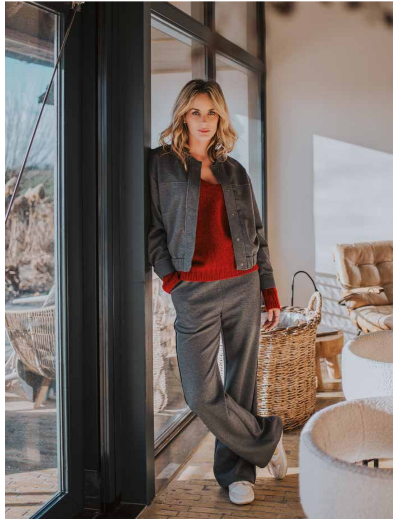
PANTS: LATINA €79,99 - CARDIGAN: HANOI €79,99