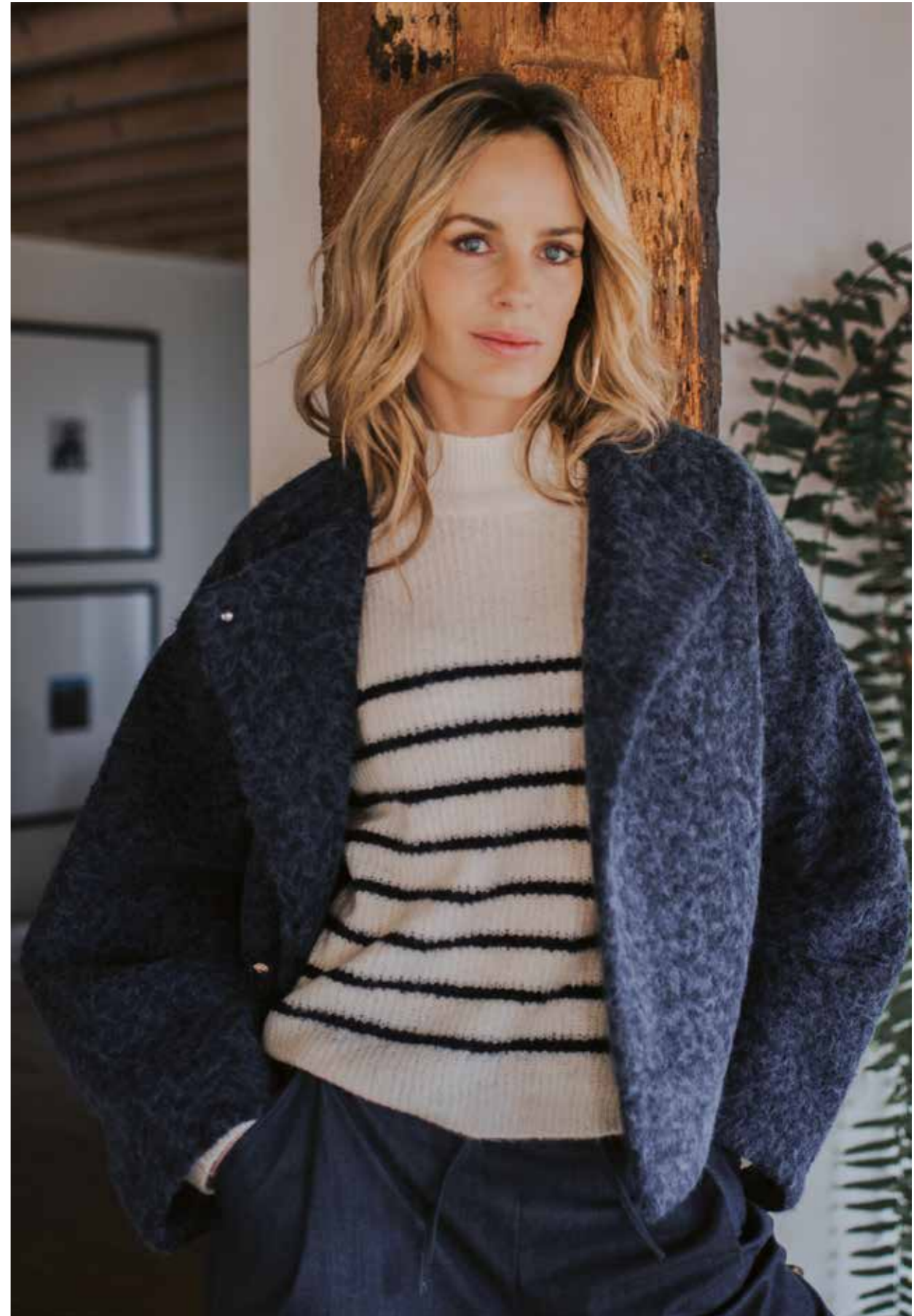
PANTS: ISTANBUL €89,99 - BLAZER: JODPHUR €129,99 - TOP: ORLANDO €49,99