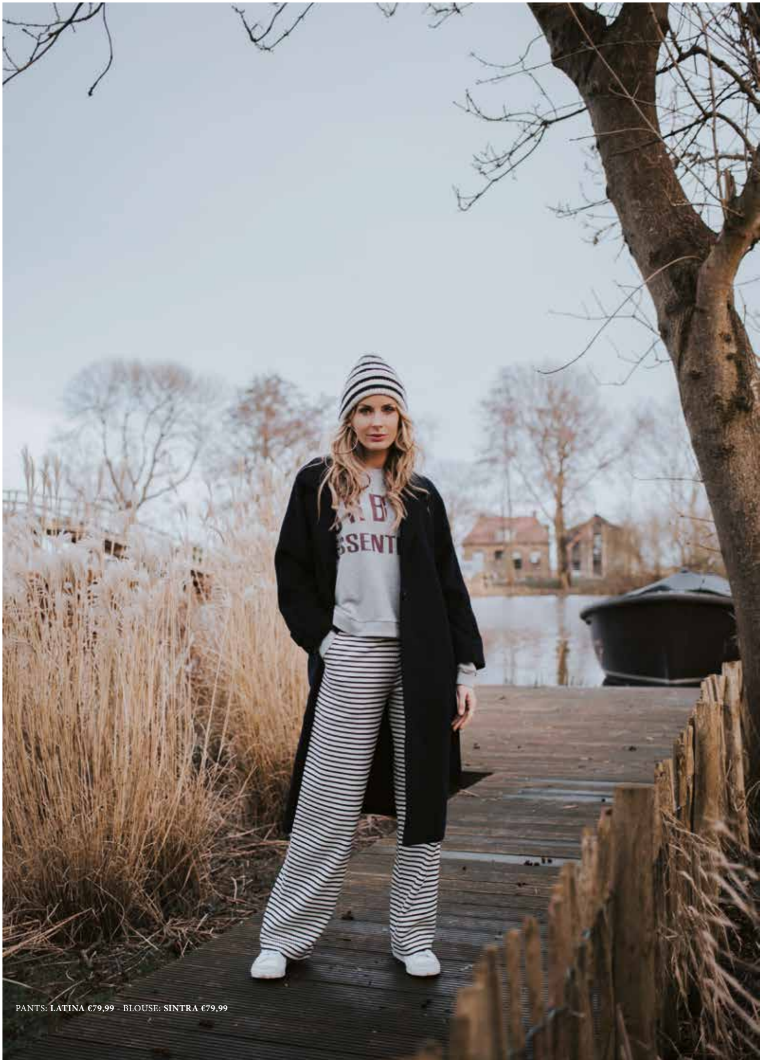
PANTS: LATINA €79,99 - BLOUSE: SINTRA €79,99