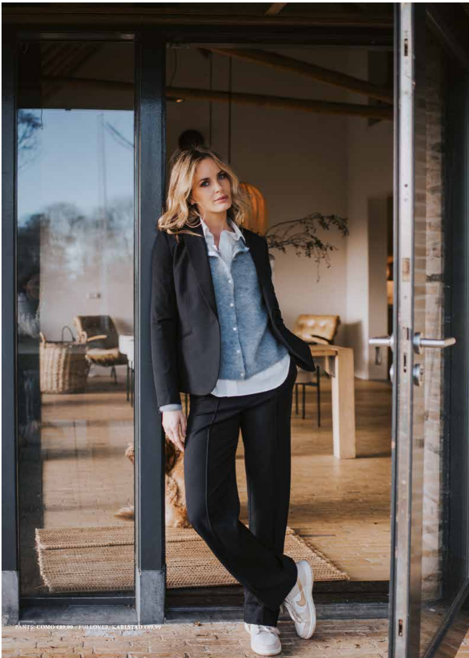
PANTS: COMO €89,99 - PULLOVER: KARISTAD €89,99