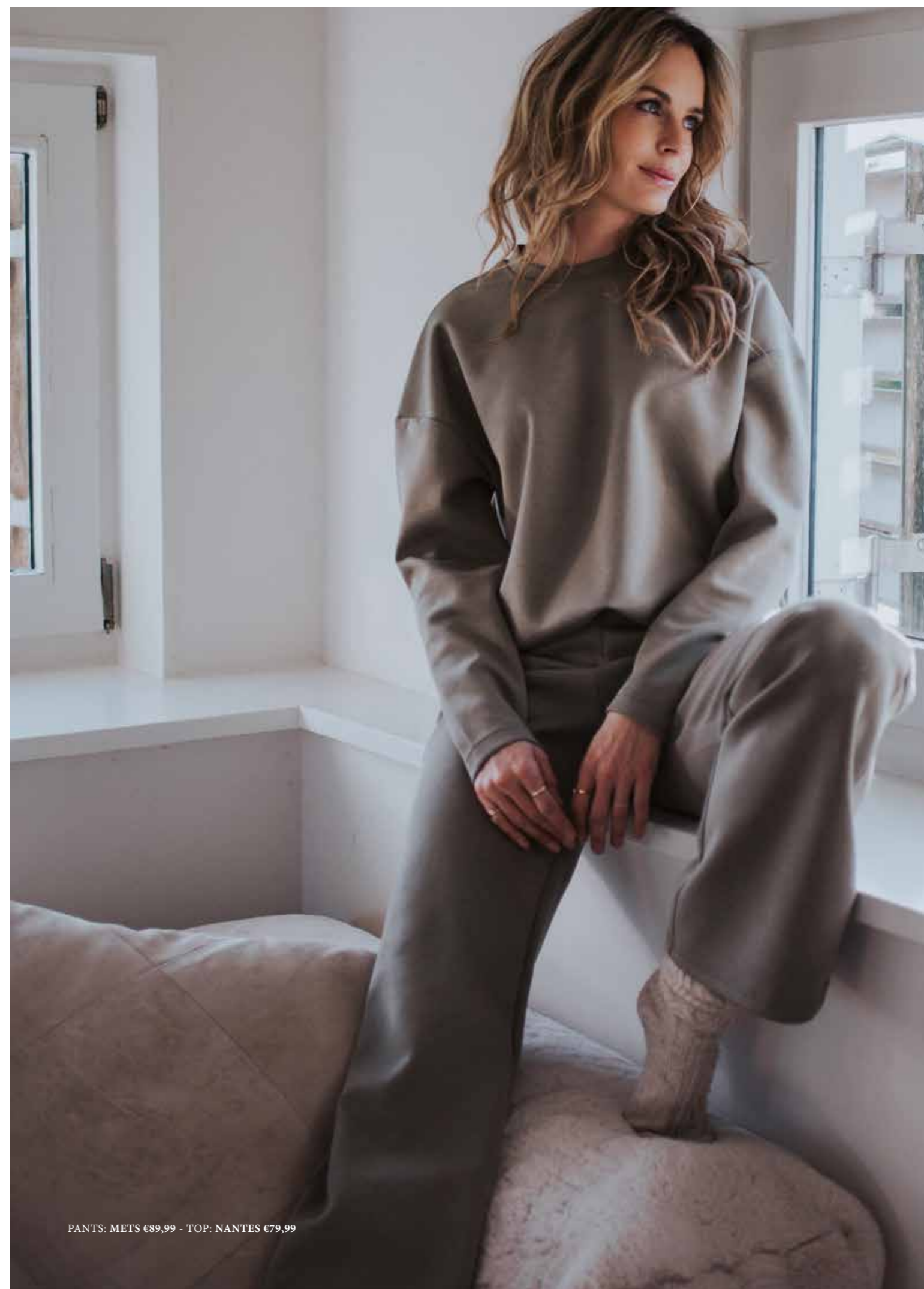
PANTS: METS €89,99 - TOP: NANTES €79,99