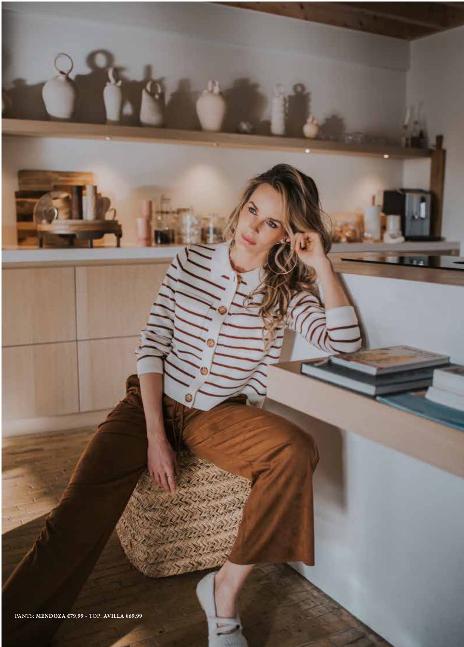
PANTS: MENDOZA €79,99 - TOP: AVILLA €69,99