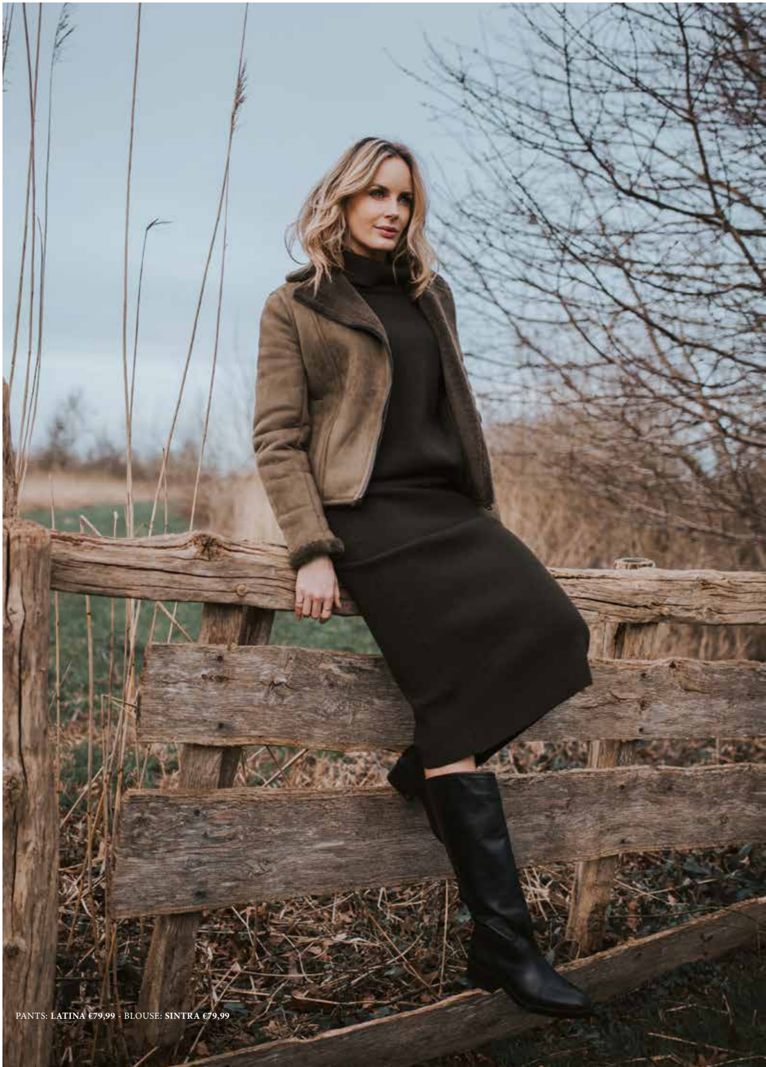
PANTS: LATINA €79,99 - BLOUSE: SINTRA €79,99