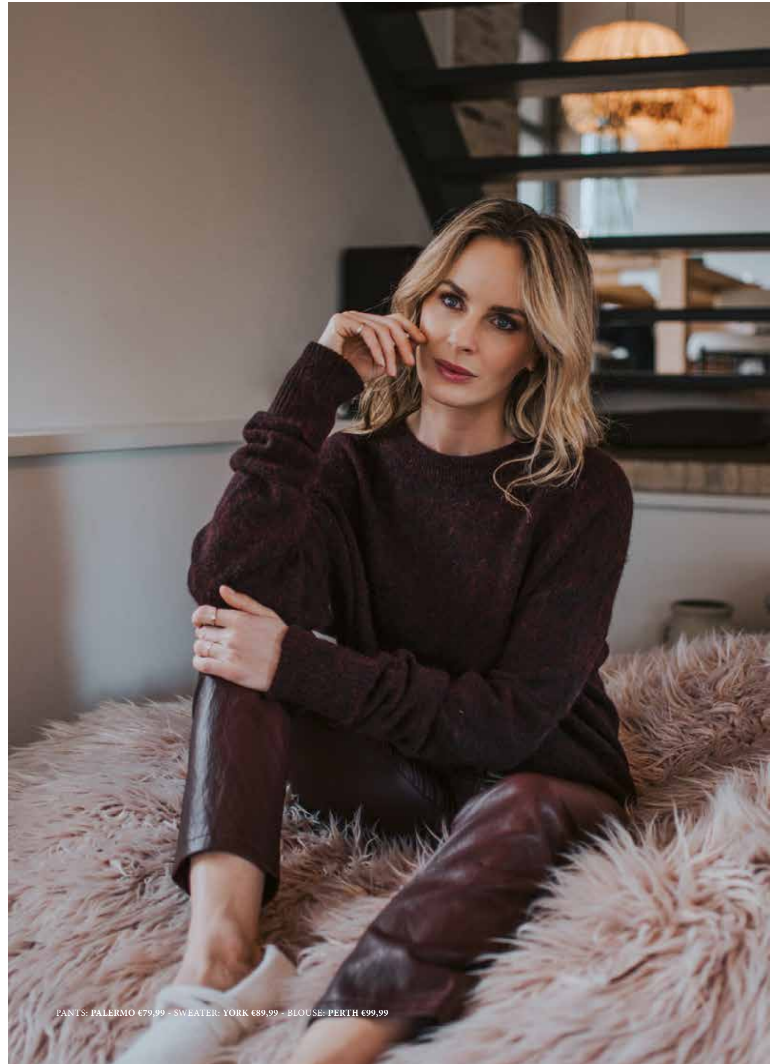
PANTS: PALERMO €79,99 - SWEATER: YORK €89,99 - BLOUSE: PERTH €99,99