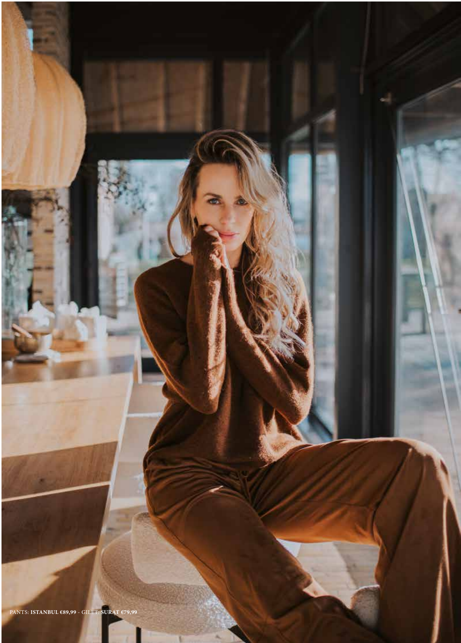
PANTS: ISTANBUL €89,99 - GILET: SURAT €79,99