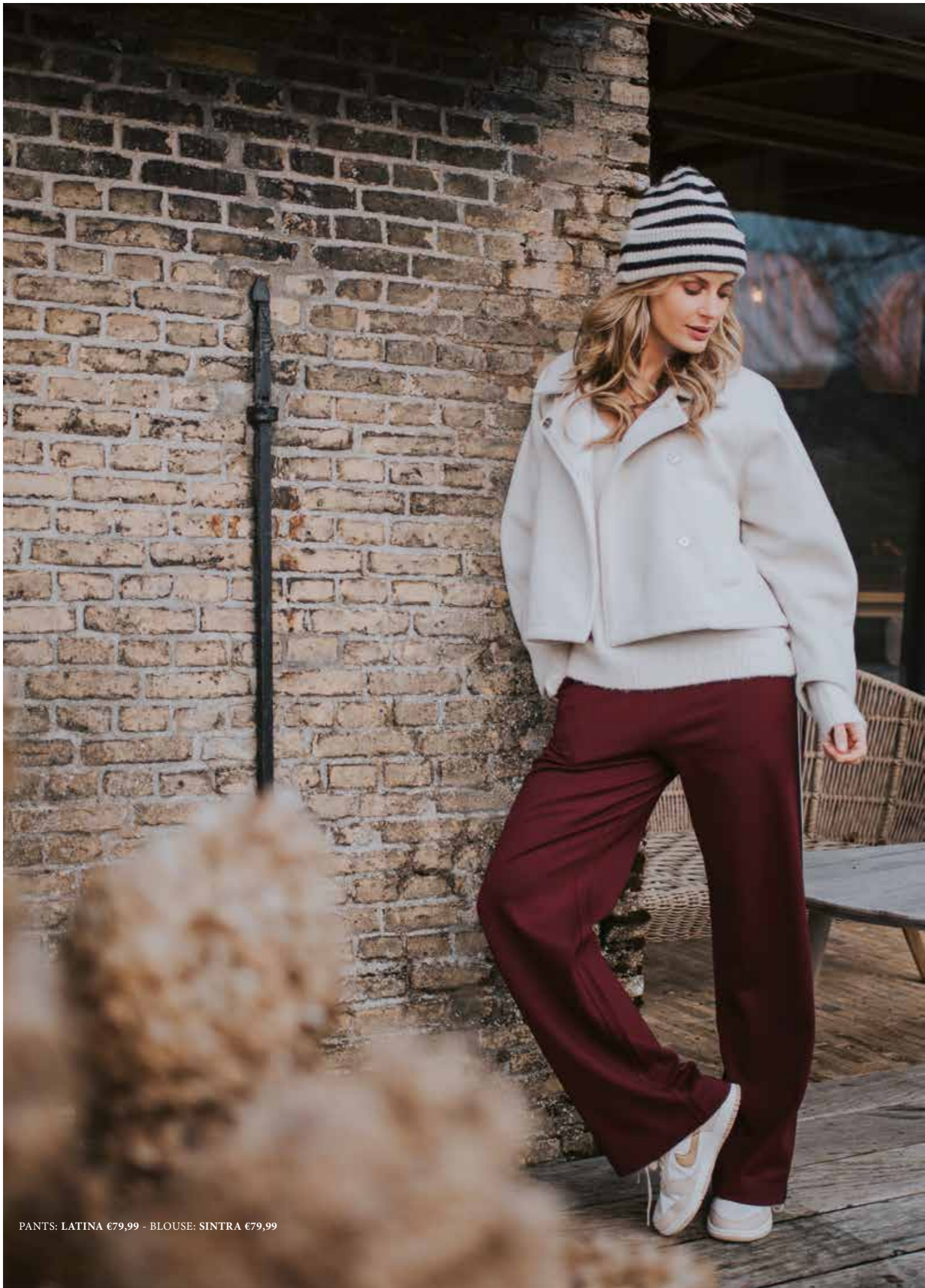
PANTS: LATINA €79,99 - BLOUSE: SINTRA €79,99