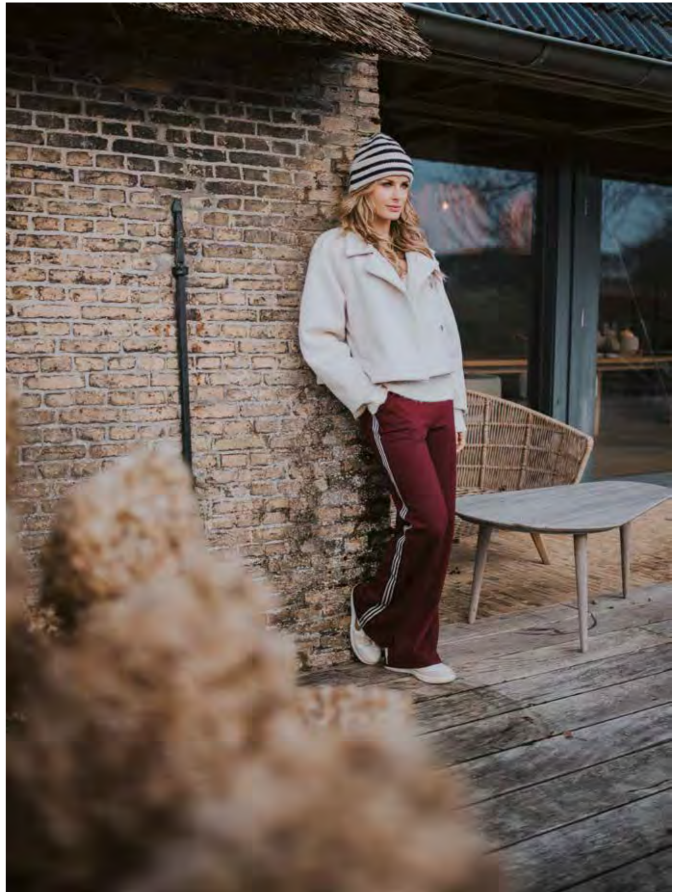
PANTS: LATINA €79,99 - CARDIGAN: HANOI €79,99