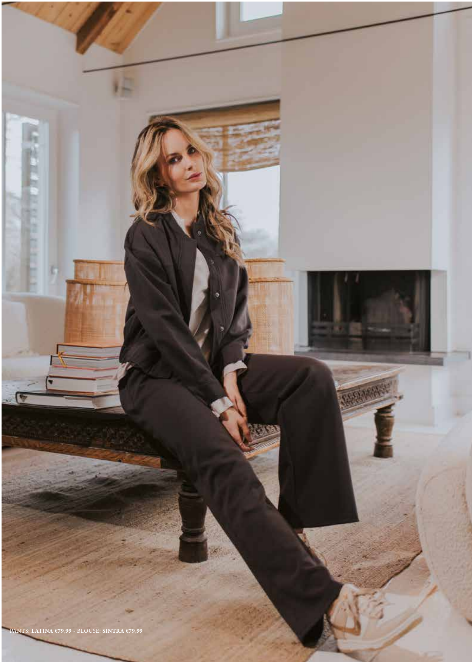
PANTS: LATINA €79,99 - BLOUSE: SINTRA €79,99