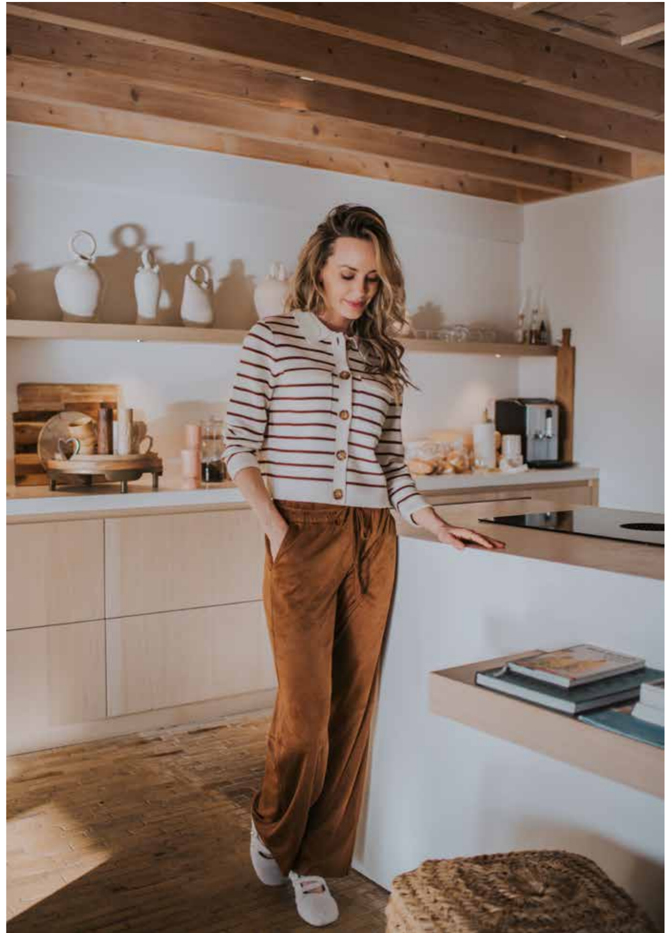
PANTS: LATINA €79,99 - PULLOVER: MURCIA €89,99