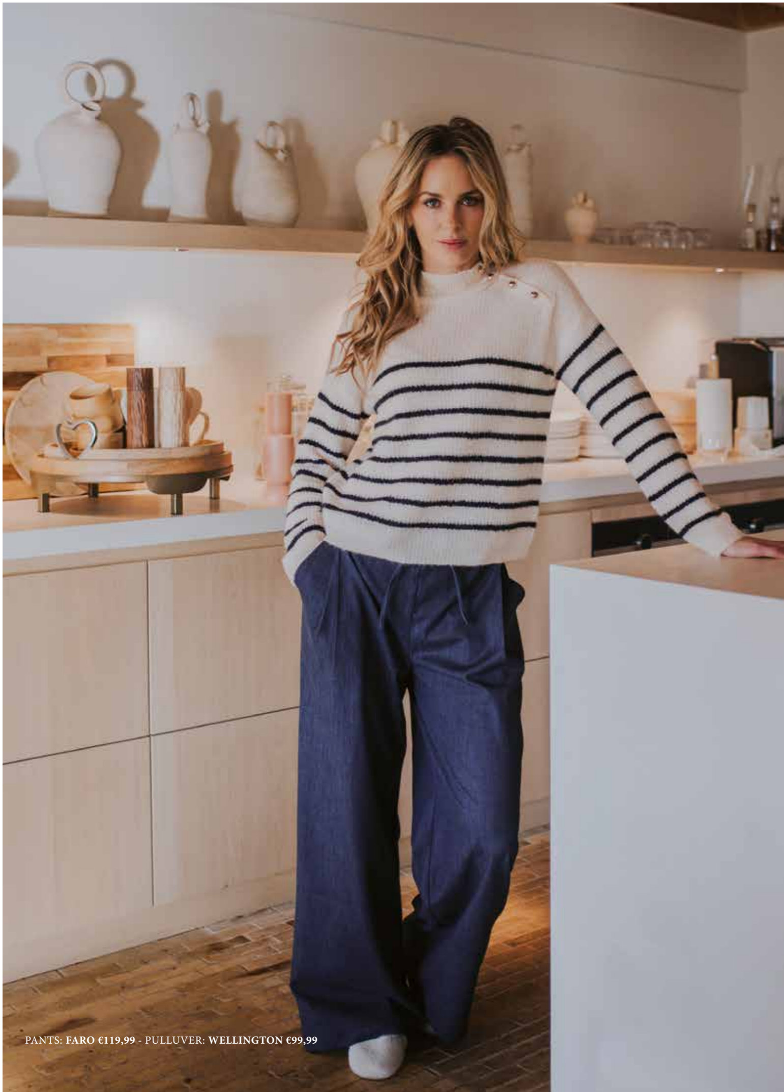
PANTS: FARO €119,99 - PULLUVER: WELLINGTON €99,99