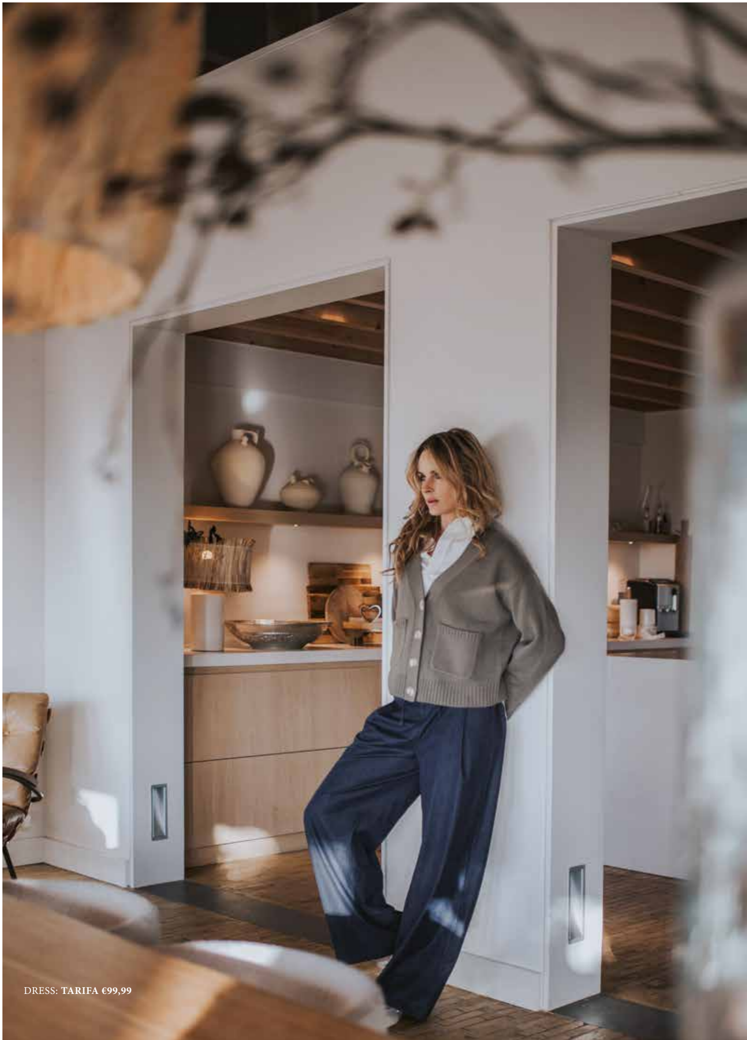
DRESS: TARIFA €99,99