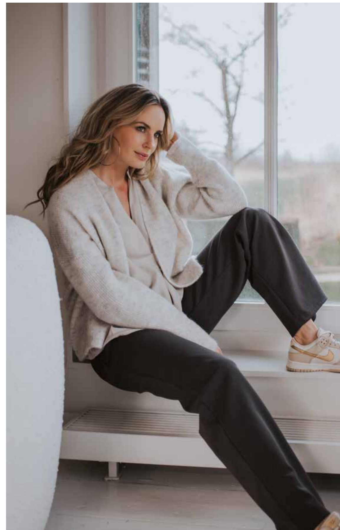
PANTS: FARO €119,99 - CARDIGAN: RONDA €119,99